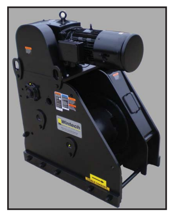
Other Drum Lengths / Cable Capacities are Available Upon Request