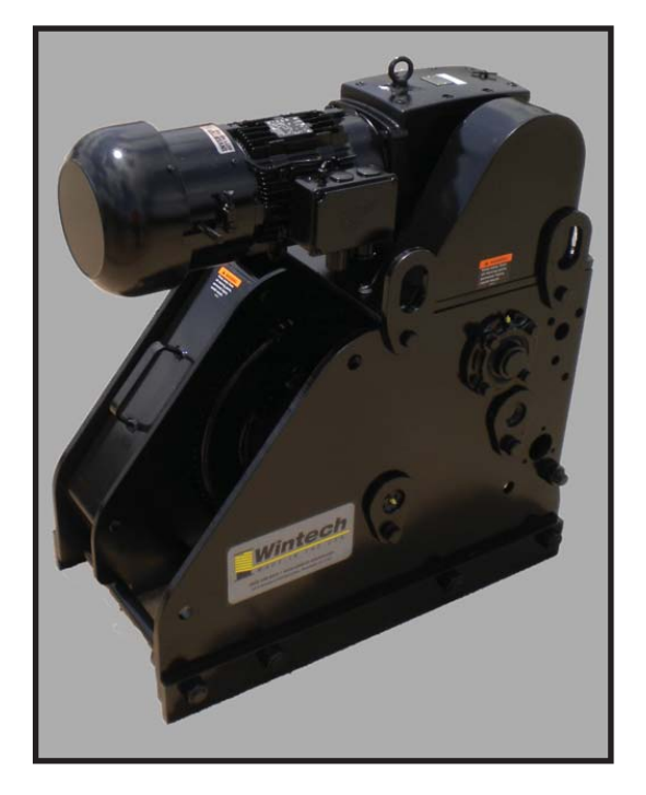
Other Drum Lengths / Cable Capacities are Available Upon Request